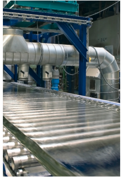
SUPREMAX ® 33 is available in large sheet sizes

SUPREMAX ® 33 is environmentally friendly and made of non-hazardous inorganic and natural raw materials. The glass can be recycled several times and disposed of without difficulties.