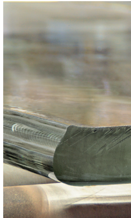
SUPREMAX® 33 ultra thick borosilicate glass